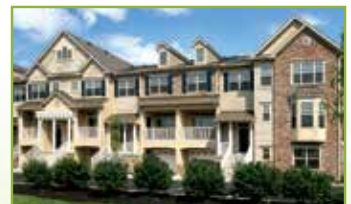
Heritage Pointe Village Way, Chalfont, PA 18914