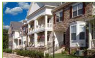
Heritage Greene 807 Ridgeview Court, Sellersville, PA 18960