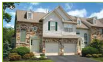
Heritage Summer Hill 4000 Lily Drive, Doylestown, PA 18902