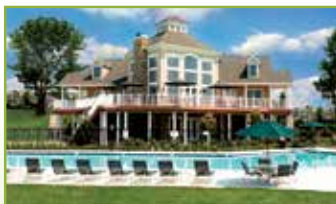
Heritage Orchard Hill - Clubhouse 1 Applewood Drive, Perkasie, PA 18944