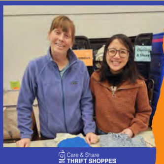
CarShare THRIFT SHOPPES

Must present ad to receive offer. Not valid with leagues, special events, holidays or any other offer. Expires 8/31/25