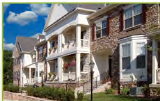
Heritage Greene • Sellersville