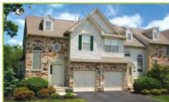
Heritage Summer Hill • Doylestown