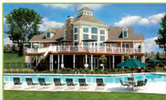
Heritage Orchard Hill - Clubhouse • Perkasie