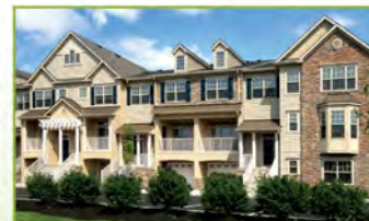
Heritage Pointe • Chalfont