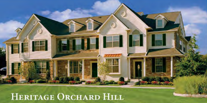
HERITAGE ORCHARD HILL