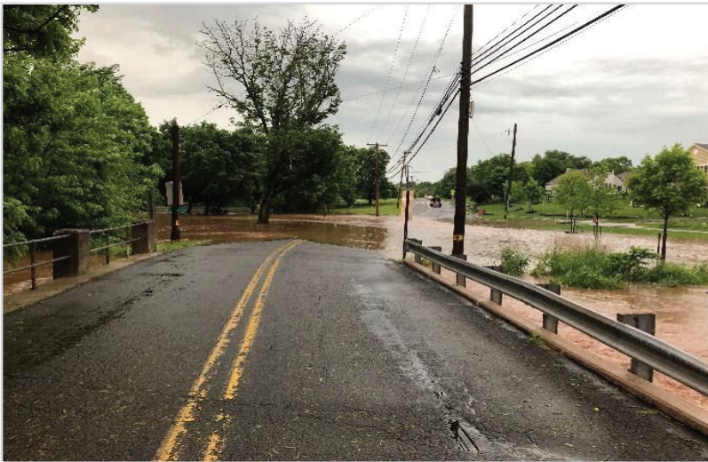
Above and Below: Alderfer Road Bridge

McMahon Associates, Inc., the Township Traffic Engineer, is completing the final design engineering in 2020. The project is anticipated to be advertised for construction over the winter and will proceed into construction in 2021. Keep an eye on the Local Construction page of the website for updates as they become available.