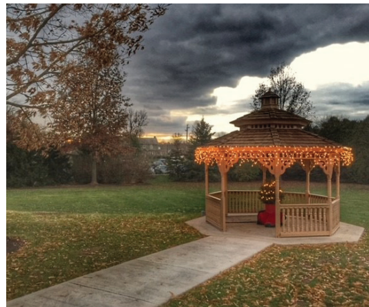
A peaceful scene at the Township Gazebo as winter begins to fall across the Township

Chairman, Lower Salford Board of Supervisors