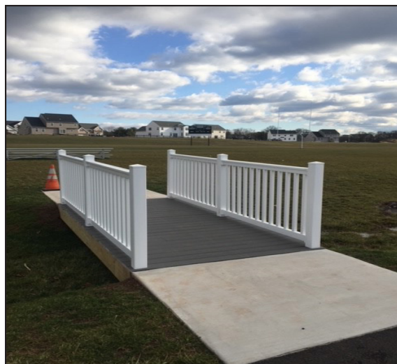
Tyler Currier: Troop 178, built a foot bridge located at the new multi-purpose fields on Park Avenue to provide safe crossing of a swale for those using the fields.