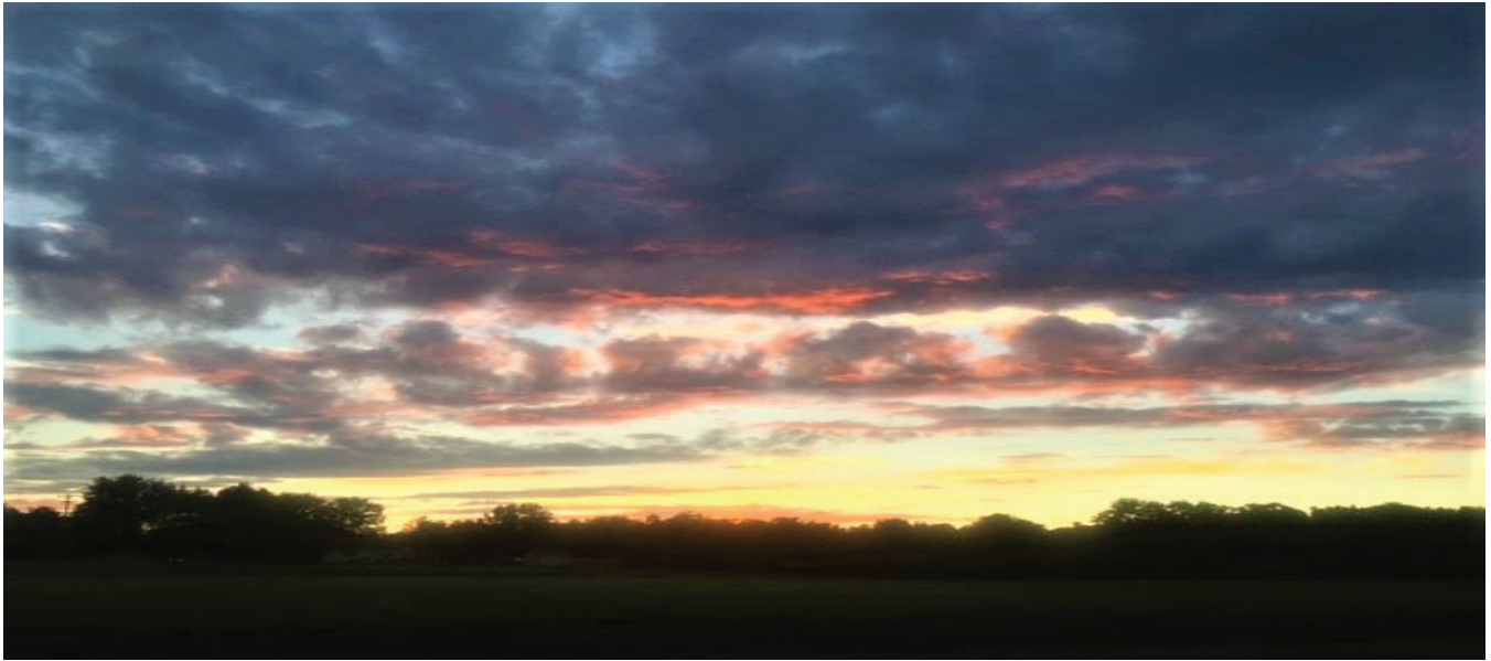
Reed Park at Sunset: Fall sunset over the Charles Reed Park baseball fields.