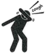
Cover your cough