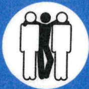
Close personal contact