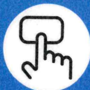
Touching surfaces with virus on it

The virus that causes COVID-19 is a novel coronavirus that was first identified during an investigation into an outbreak in Wuhan China.