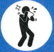
Coughing and Sneezing

COVID-19 is a respiratory illness that can spread from person to person just like a cold or the flu.